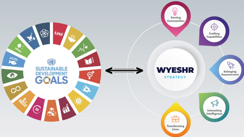
Fig. Strategic Action Plan for Sustainable Development Goals - 2030